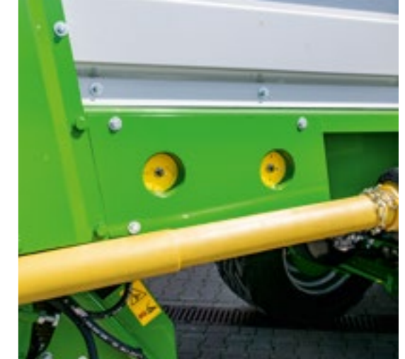
The drawbar and knife beam can be easily adjusted on the left side of the vehicle.