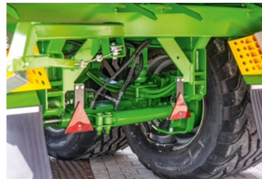
A follow-up steering system is optionally available for even greater driving comfort, significantly less tire wear and more ground protection.