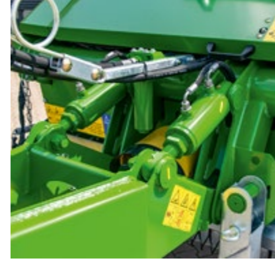
The trailer height can be easily adjusted.