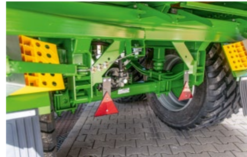
All ROYAL models are equipped with a high-quality 4-spring-assembly . This provides high stability, driving comfort and smooth towing.