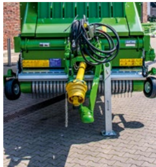
The narrow drawbar design ensures high manoeuvrability and low wear. The jack stand can be swivelled up and fastened to the frame.

The hydraulic chassis is optionally available. The 300 mm hydraulic axle compensation provides for the best driving performance, the highest standing and driving safety, stability and off-road handling. Bumps are reliably absorbed, ground pressure is significantly reduced and wheel sinking in is minimized.