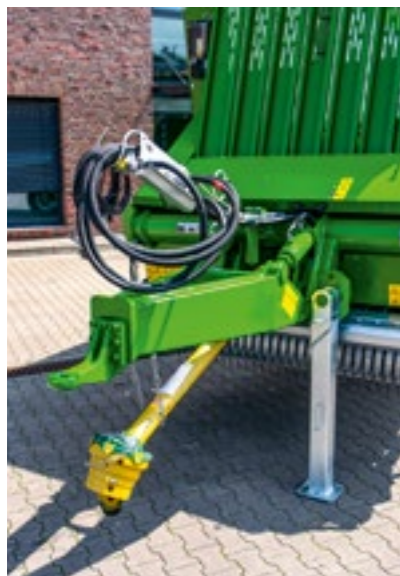
The ROYAL models are equipped with high drawbar as standard.