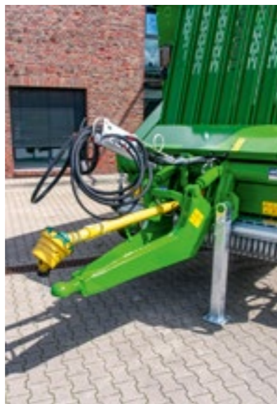
The low drawbar is optionally available.