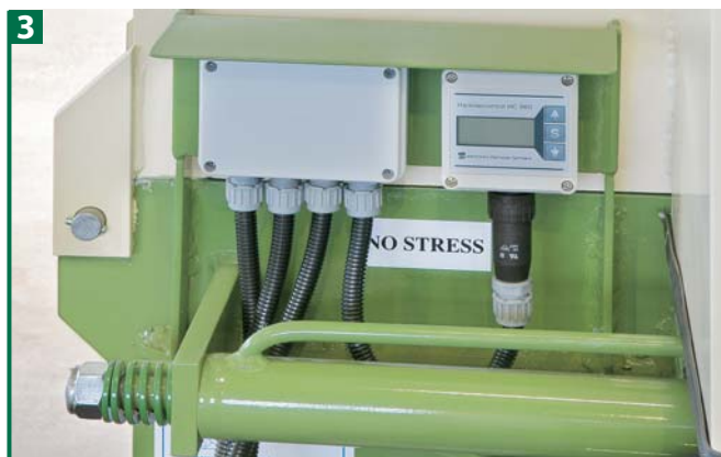
3 The electronic “no stress” device adjusts feeding of the material to be chipped, in relation to the power available, eliminating wearing forces.

All Pezzolato chipping devices can be supplied with the “no stress” device that assures long duration of the machine, as it stops the feeding system of the material to be chipped for a few moments, if there is excessive power absorption by the motor. The “no stress” automatically re-starts the feeding system, as soon as power absorption returns to normal (cf. photo 3).