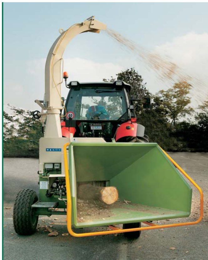
Chipping machine H 880/250 can chip logs up to 25 cm of diameter.