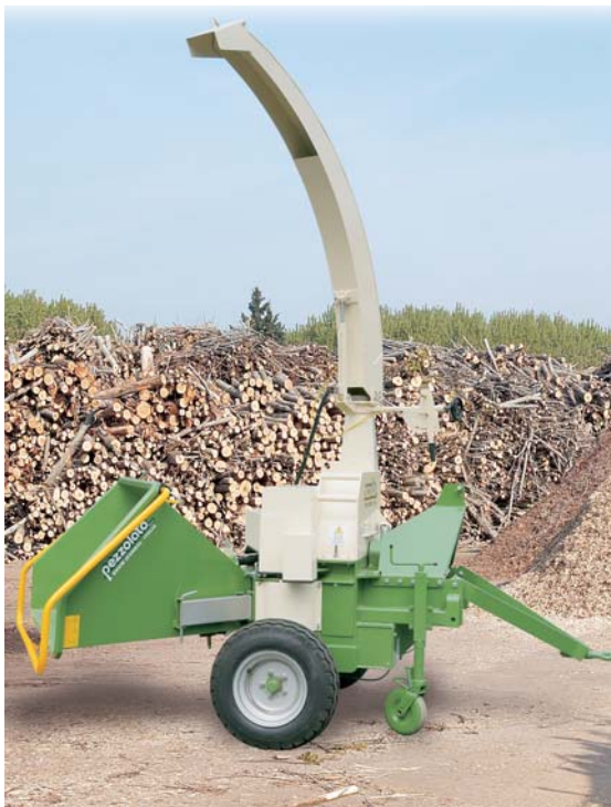
Chipping machine for chips heating system H 980/300 with extended output conveyor, equipped by hydraulic movements for deflector lifting, rotation and orientation

In the two establishments (an area of 70,000 m 2 of which 28,000 m 2 are covered, with more than 150 employees), the Company manages three production lines, among which the “ GREENLINE ” that plans and designs the wide range of CE marked machines, PTH series drum chippers in compliance with the machinery directory. H series disc chippers, PZ series grinders for volume reduction as well as the shredders for the disposal of waste solids, turning machines and Sieves for the preparation of the compost can be added to these.