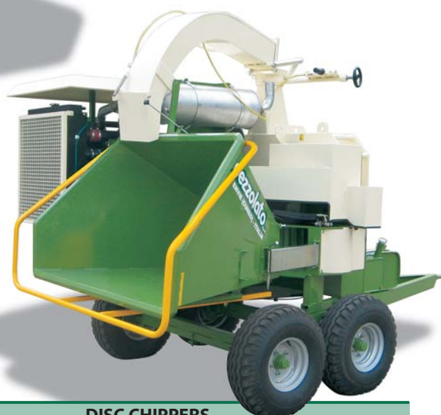
The H 980/300 M version chipping machine (equipped with an autonomous 150 HP engine), in transport position.