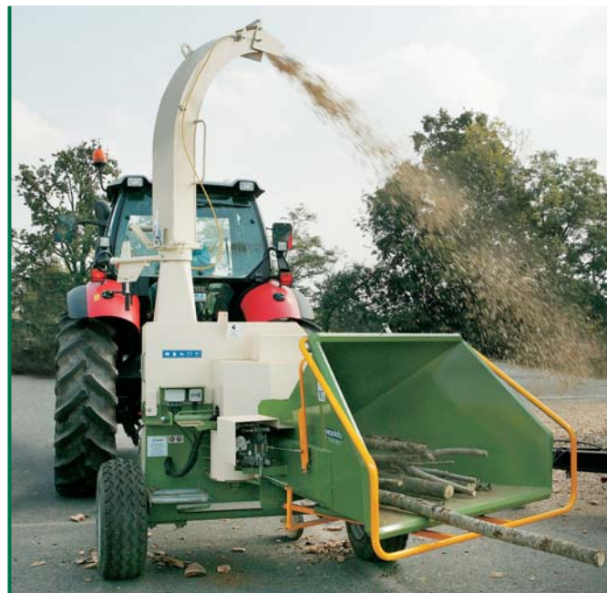
Chipping machine H 880/250 at work with little logs and slashes.

The exclusive H 780/200 "L version" model that produces "mini-chips" also from small branches must be added to these machines.