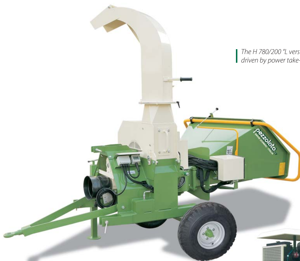
The H 780/200 "L version" chipping machine driven by power take-off from the tractor.

The machine can be driven by power take-off from a tractor or with a diesel or electric engine.