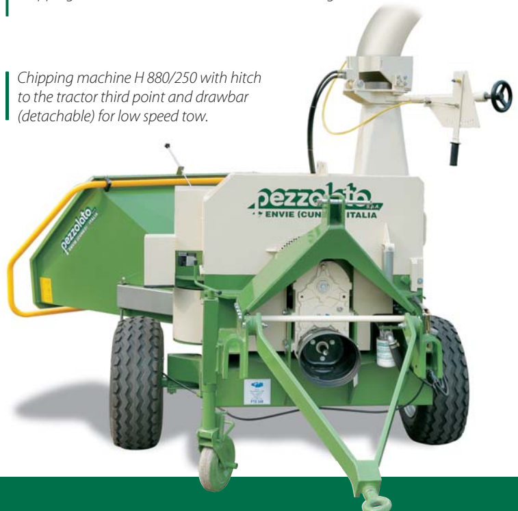
Chipping machine H 880/250 with hitch to the tractor third point and drawbar (detachable) for low speed tow.