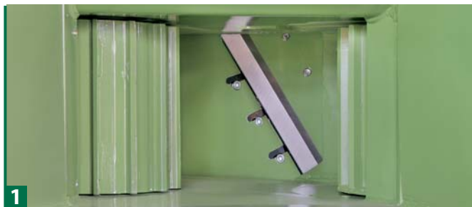
1 Detail of the material feeding mouth; the feeding rollers are visible on the base and, in the background, the disc with a chipping knife. Roller speed can be adjusted by the operator, in relation to the type of material to be chipped.

The chute can be moved by 270° and can be supplied with hydraulic controls.