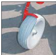
Steel depth wheel (500x160mm).