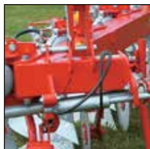
Hydraulic front furrow adjustment.