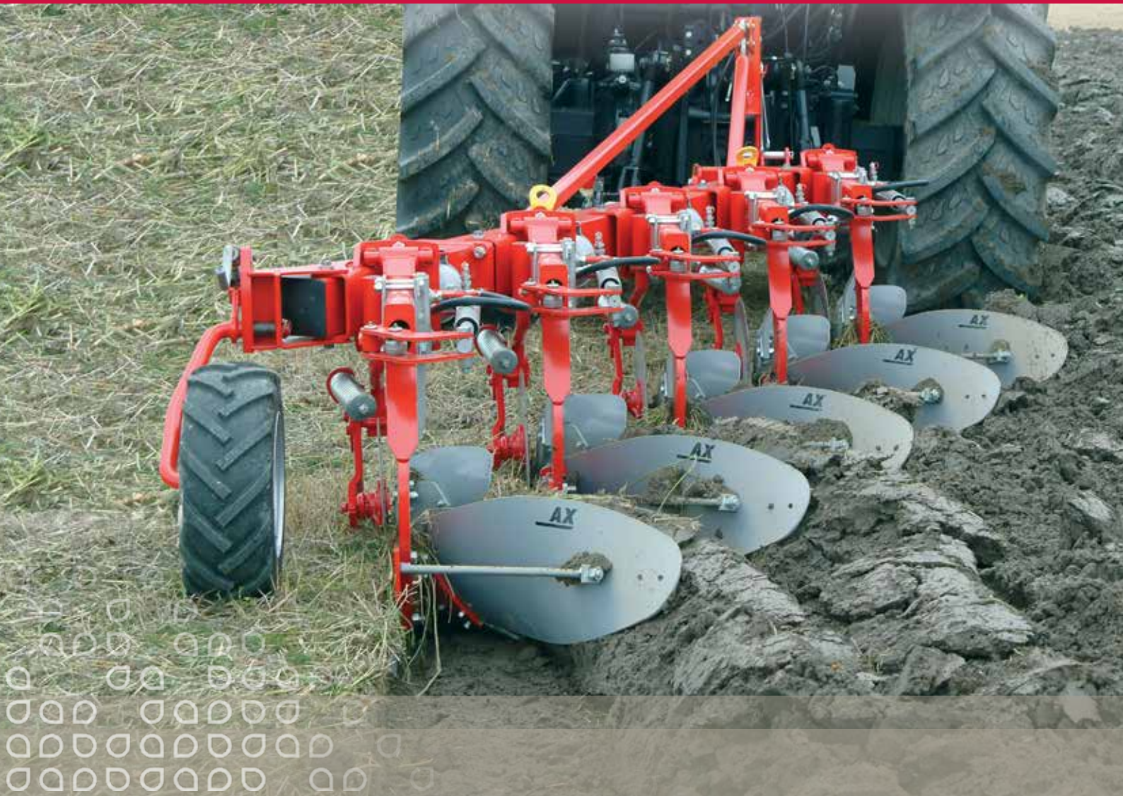
Mounted conventional Ploughs