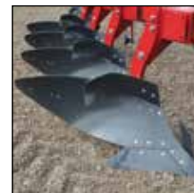
Knife coulter, coverboard and furrow widening knife.