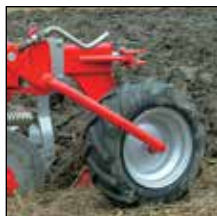
Rubber depth wheel (574x213).