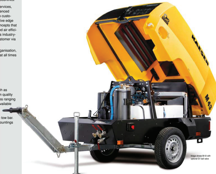
Image shows M 43 with optional G1 ball valve