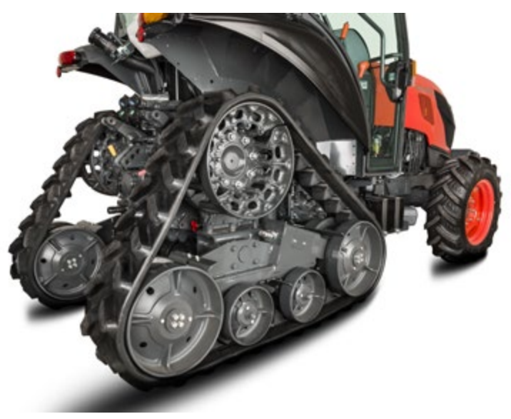
Power crawler as option available for even more traction

The front axle with bevel gear drive and a steering angle of an astounding 55° give the M5001N unique agility. This makes the tractor ideal for jobs in tight spaces. Kubota has now been using front axles with bevel gear drives for over 30 years. For good reason, as this combination is not only responsible for the extremely tight turning radius, but also does not require high-maintenance universal joints.