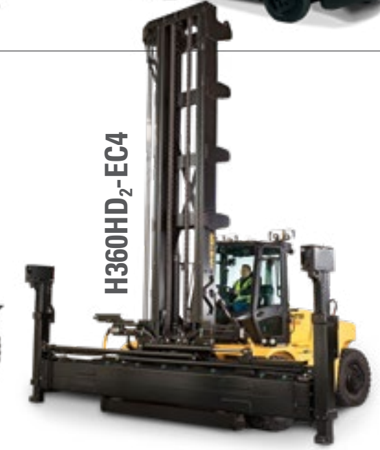
H360HD 2 -EC4