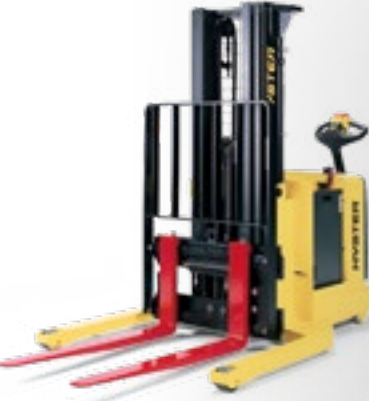
W25-30ZA 2 , W40ZA, W20-30ZR, W25-40ZC