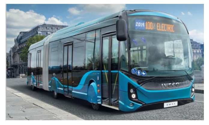
E-WAY FULL ELECTRIC - 18m