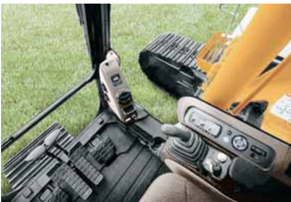
The one-piece right-hand window provides a clear view to the inside of the right track, making it easier to position for work alongside a trench or boarding a trailer.

For faster, easier cab cleaning, the height on the floor mat has been increased to be level with the door for more convenient in/out and easier cleaning.