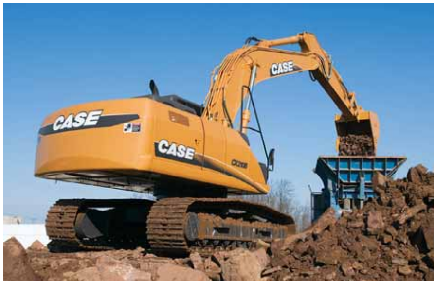
CX210B Narrow with a track width of 8 ft. 6 in. (2.59 m) offers easy transporting with the performance of a 21 metric ton excavator.

A standard bucket digging force of 31,923 lb. (142 kN) on the CX210B keeps your work moving smoothly.