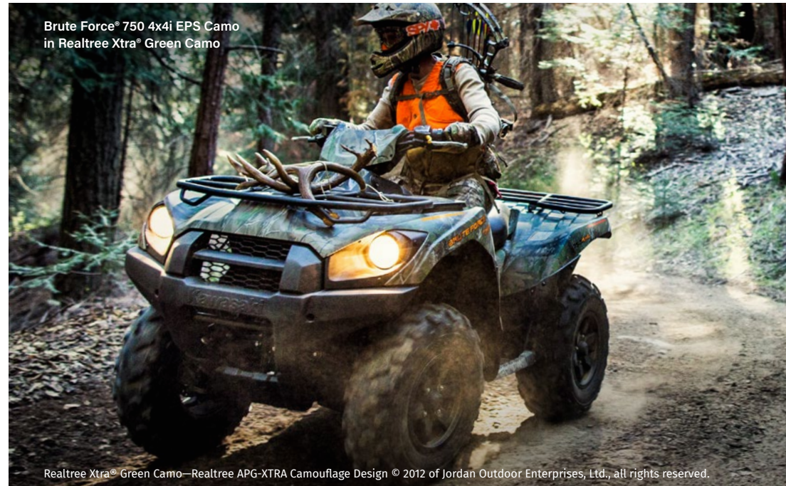
Brute Force® 750 4x4i EPS Camo in Realtree Xtra® Green Camo

The fuel-injected 749cc V-twin engine pumps out strong low-rpm torque for incredible acceleration, while precise fuel metering allows for easy starting and optimum fuel mileage.