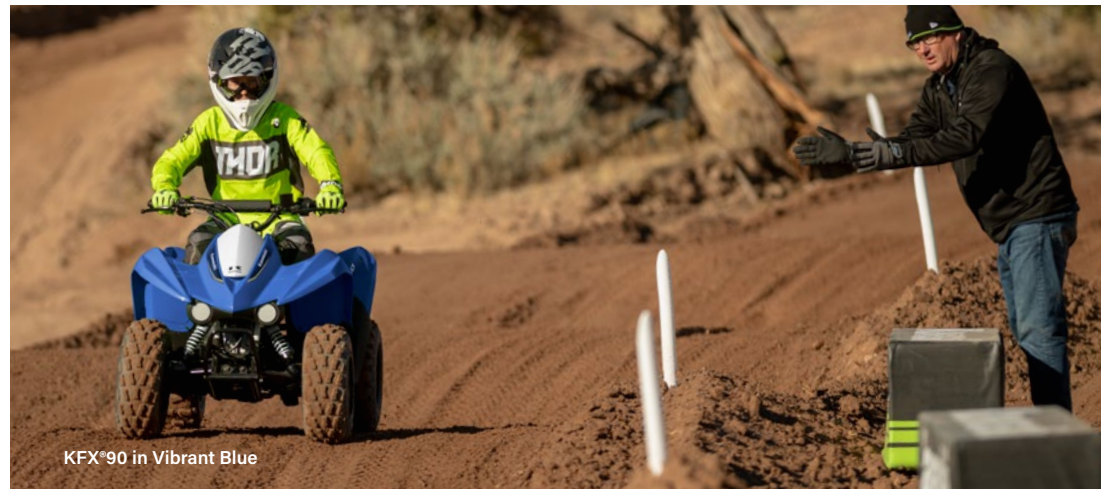
KFX®90 in Vibrant Blue

Smooth and sporty suspension performance is produced by independent front A-arms and a single shock and swingarm in the rear. At higher speeds, the KFX®90 ATV exhibits agile performance and capable handling which riders with more experience can appreciate.