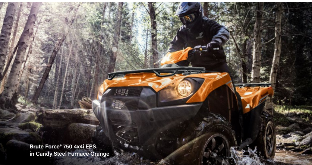
Brute Force® 750 4x4i EPS in Candy Steel Furnace Orange

Durability and strength are the result of a reinforced double-cradle frame. Independent suspension smooths out rough terrain with pre-load adjustable shocks.