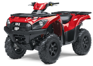
BRUTE FORCE® 750 4x4i EPS