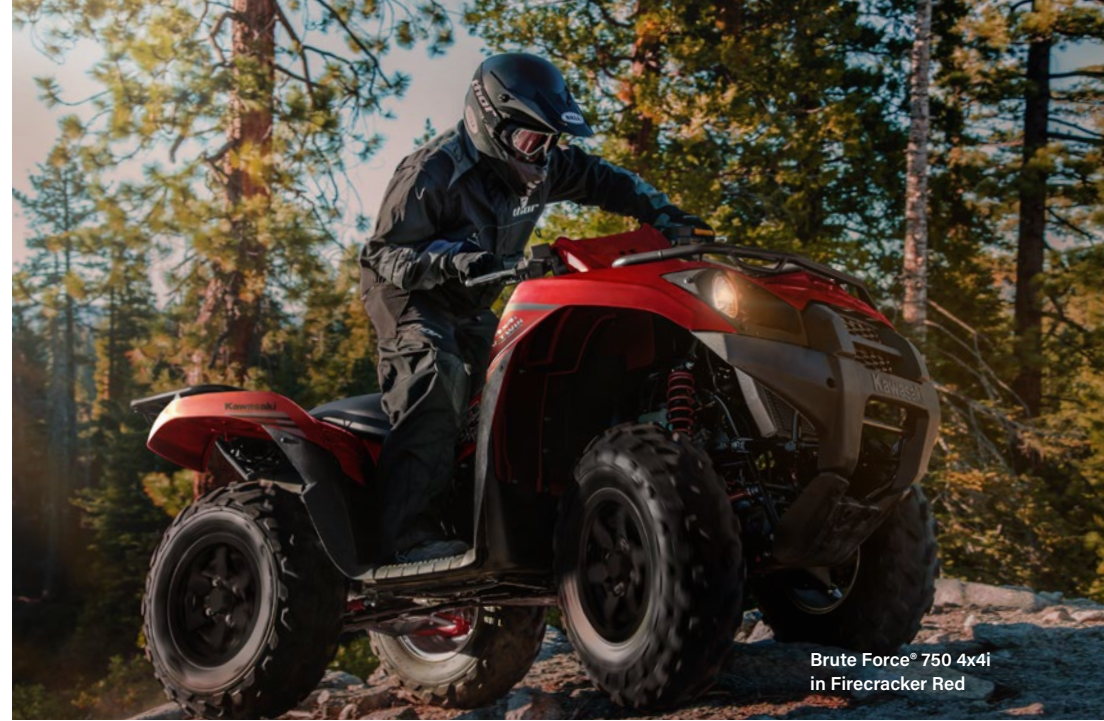
Brute Force® 750 4x4i in Firecracker Red