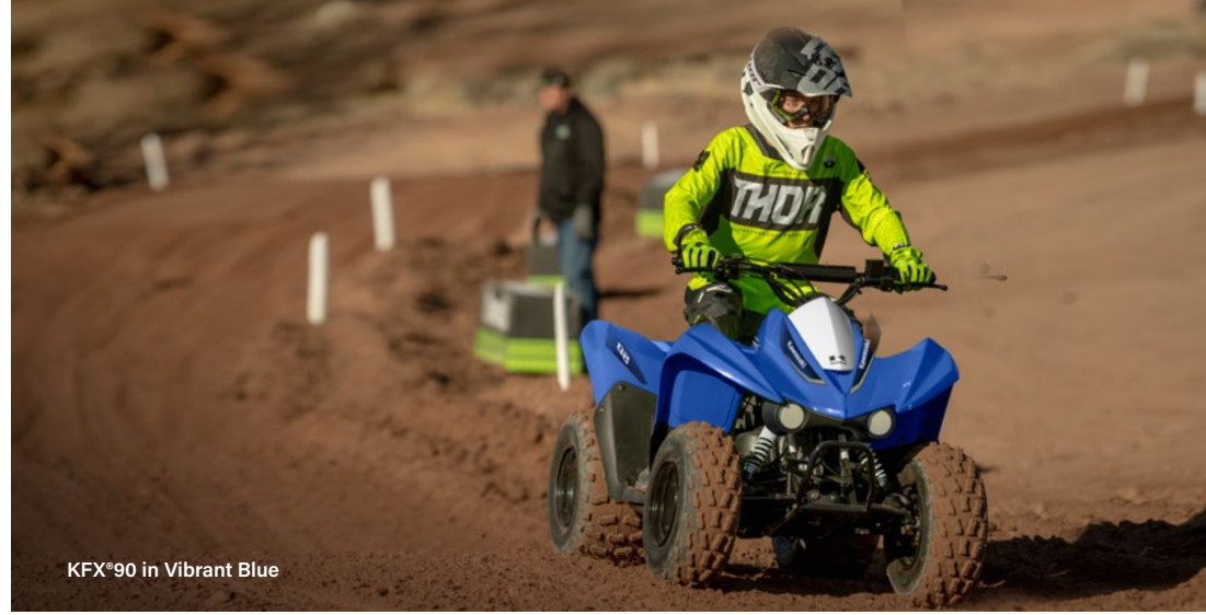
KFX®90 in Vibrant Blue