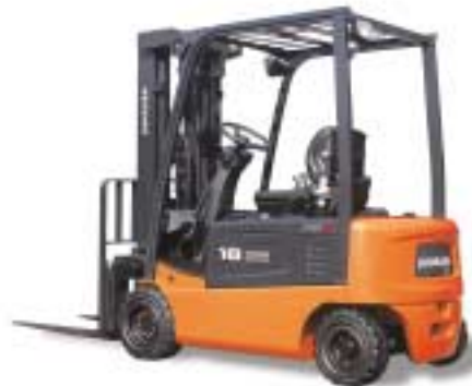
B16X / B18X / B20X - 5 Capacity Range 1,600 - 2,000kg 4 Wheel