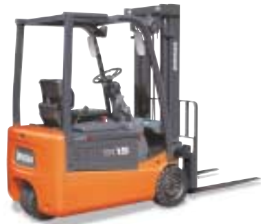
B15T / B18T / B20T - 5 Capacity Range 1,500 - 2,000kg 3 Wheel