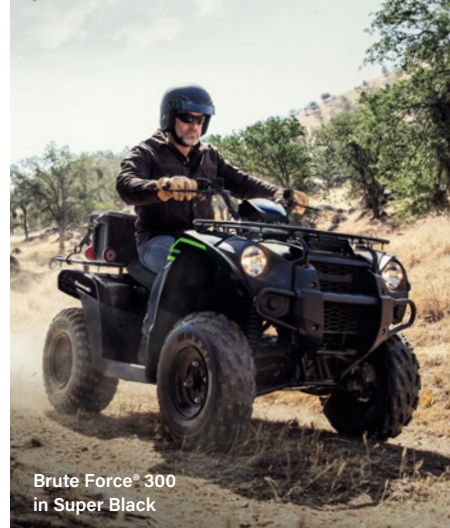
Brute Force® 300 in Super Black