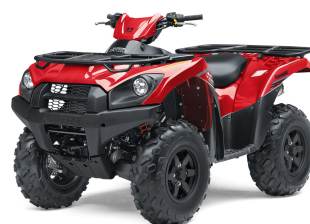
BRUTE FORCE® 750 4x4i EPS