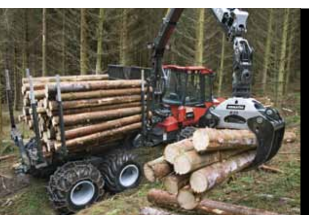
Fast and nimble thinning loader with an efficient workflow. Specially developed for the 830.3 with very good loader geometry and a lifting torque increased to 74 kNm (54,600 lb-ft).

Much of the improved performance can be summed up as more brawn. The 830.3's powerful, efficient and environmentally-friendly Tier 3 engine