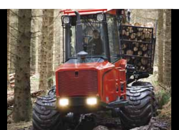
Superb mobility thanks to a steep nose angle, high ground clearance, low center of gravity, and low load height.