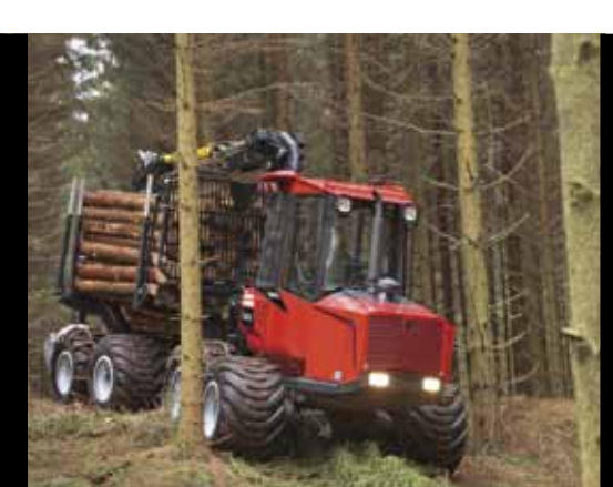
Extremely fast and nimble even when carrying a full load, much due to the high tractive force and superb tracking capability.