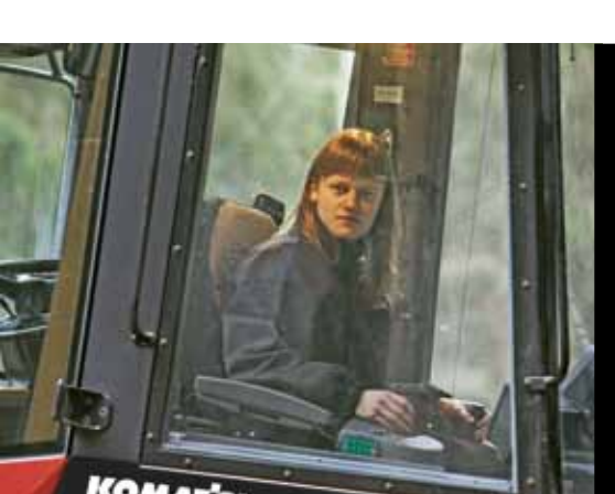
Great comfort and ergonomics that include a well isolated cab with more than sufficient cooling and heating capacity.

More world-leading qualities: The superb mobility achieved by teaming high ground clearance with a low center of gravity. The good tracking capability and even weight distribution make this machine incredibly gentle on the ground. Choose the Komatsu 830.3 and you're properly equipped to thin.